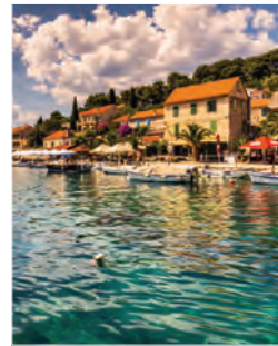
Central & Eastern Europe