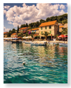
Central & Eastern Europe