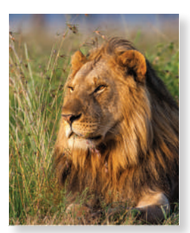
Kenya & Tanzania